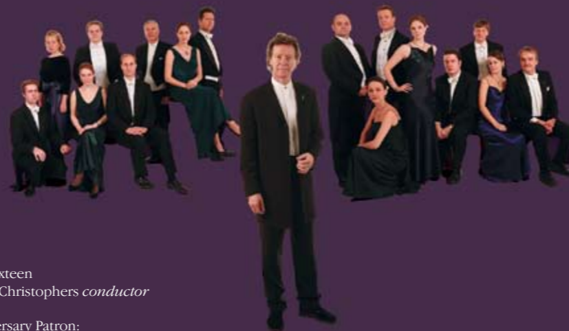
The Sixteen Harry Christophers conductor

Anniversary Patron: Simon Russell Beale CBE